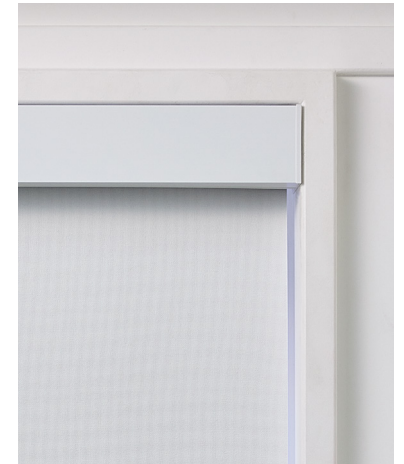
100mm Square Fascia