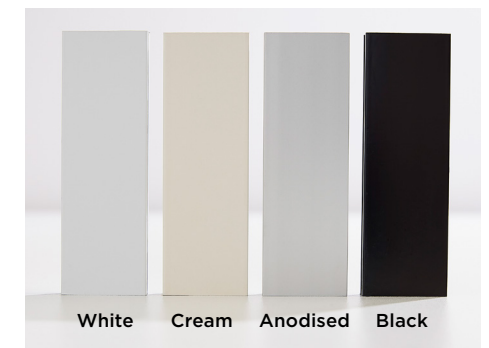
Flat Deluxe Bottom Rail

The square design is a contemporary look for modern homes.