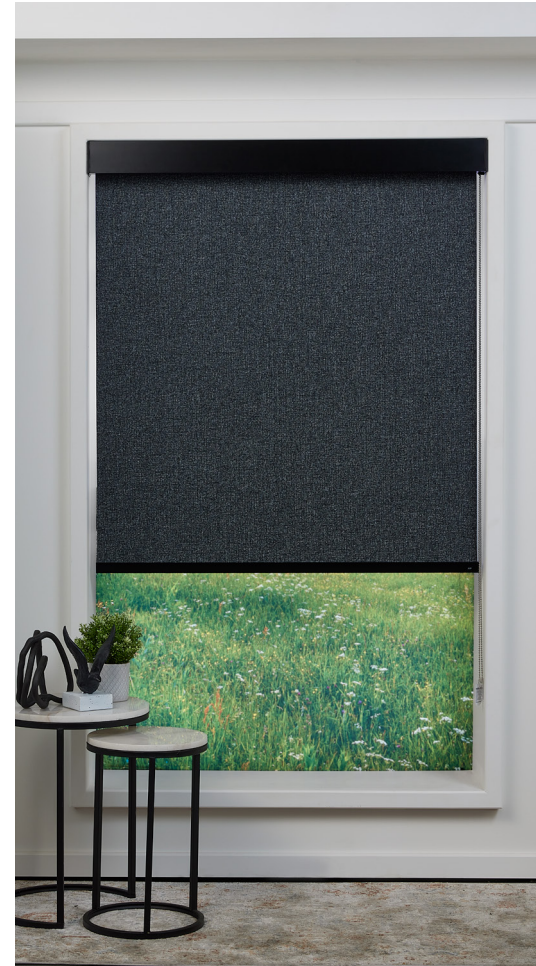
75mm Square Fascia

Standard roller blinds are available in all operating options. Customise with your choice of control side, face or reveal fit and either standard or reverse roll depending on your fabric selection and light control needs. You can choose from 38mm, 50mm and 63mm tubes.