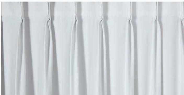
Double Pinch Pleat