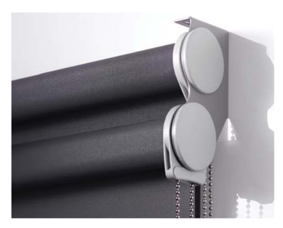
Standard Dual Roller