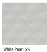
White Pearl 5%