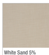
White Sand 5%