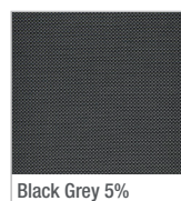
Black Grey 5%