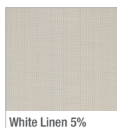
White Linen 5%