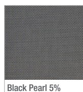
Black Pearl 5%