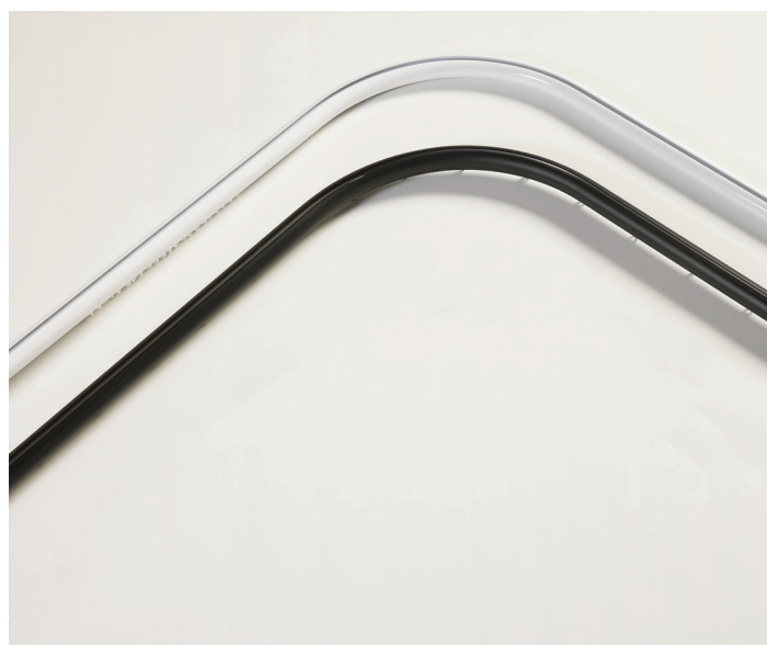
Bent Rod Tracks