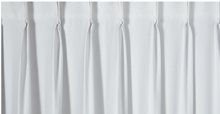
Double Pinch Pleat